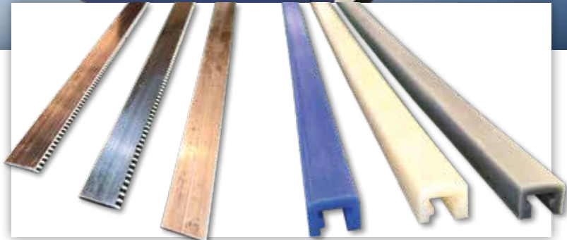
Multiple Scores & Perfs