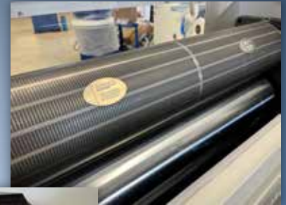
Magnetic Flexible Dies