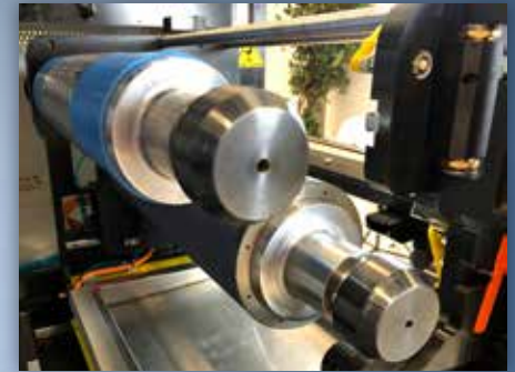
Quick Change Sleeves