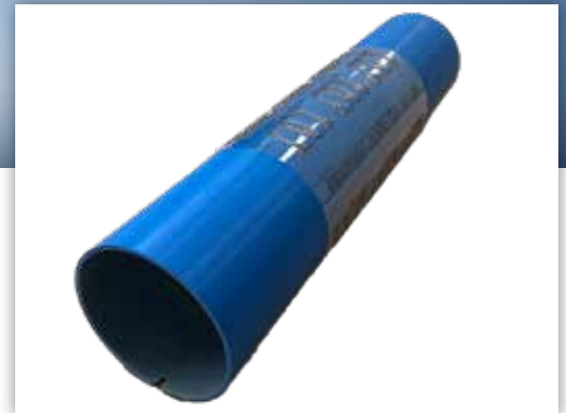
Image Cylinder Sleeve and Plate